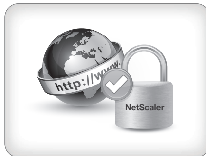
Figure 2: Citrix NetScaler secures web applications.

HTTP protocol validations. Enforcing RFC compliance and best practices for HTTP use is a highly effective way that NetScaler eliminates an entire swathe of attacks based on malformed requests and illegal HTTP protocol behavior. Additional custom checks can also be added to the security policy by taking advantage of integrated content filtering, custom response actions, and bi-directional HTTP re-write capabilities. Potential use cases expand to include: preventing users from accessing specified parts of a web site unless they are connecting from authorized locations; defending against HTTP-based threats (e.g., Nimda, Code Red), and removing information from server responses that could be used to perpetrate an attack.