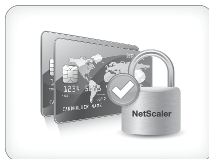
Figure 1: NetScaler protects against the leakage of confidential customer information.

NetScaler also provides Credit Card check to prevent inadvertent leakage of credit card numbers. Inspection of header information and payload data provides the thoroughness needed to avoid false negatives, while algorithmic string matching delivers the high-accuracy detection needed to avoid false positives. If a credit card number is discovered, and the administrator has not allowed credit cards numbers to be sent for the app in question, then the response can be blocked in its entirety, or the firewall can be set to mask all but the last 4 digits of the number (e.g., xxxx-xxxx-xxxx-5678).